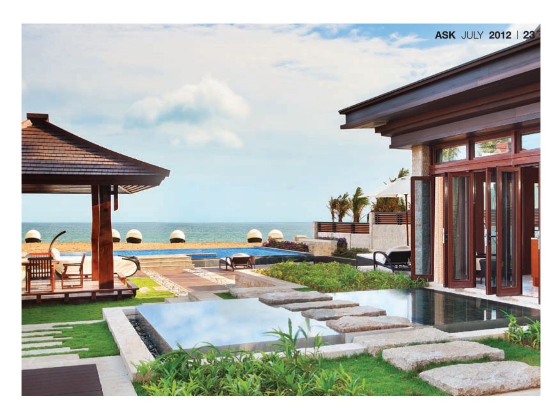
The St. Regis Sanya Yalong Bay Resort in Sanya, Hainan Island, China is an exciting new project blessed with a collection of fine furnishings and wonderful artifacts that evoke a sense of worldly travel. Every turn and corner is a design masterpiece that demands admiration and inspires a powerful sense of privilege.

DiLeonardo , the global full service architectural firm who is behind this excellent project is headquartered in Providence, Rhode Island and has offices in Dubai, Hong Kong, Shanghai and Malaysia. Their studio work environment, no bureaucracy policies and recruitment of young innovative designers sets them apart from anyone else and ensures that their projects are always fresh and cutting edge.