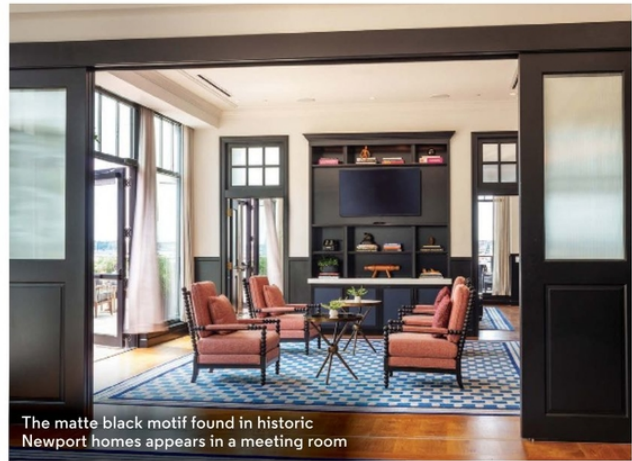
The matte black motif found in historic Newport homes appears in a meeting room