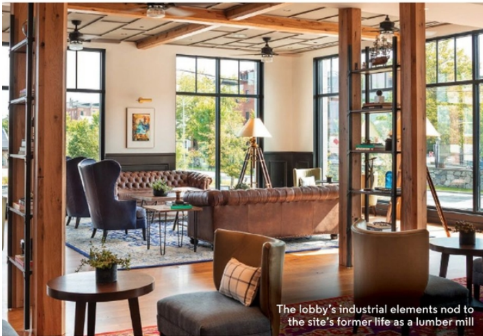
The lobby's industrial elements nod to the site's former life as a lumber mill