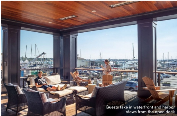
Guests take in waterfront and harbor views from the open deck