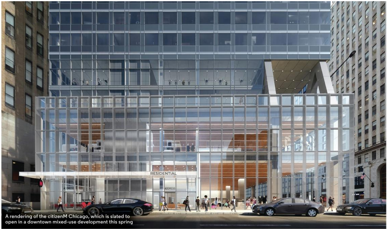
A rendering of the citizenM Chicago, which is slated to open in a downtown mixed-use development this spring