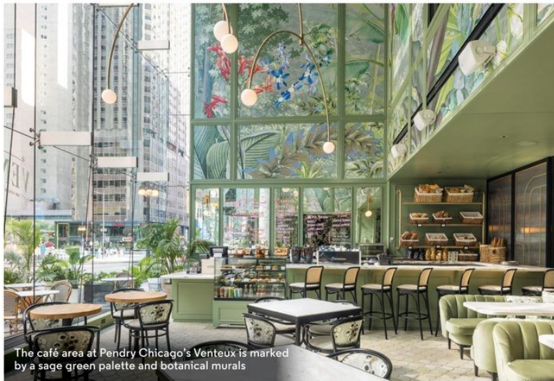
The café area at Pendry Chicago's Venteux is marked by a sage green palette and botanical murals