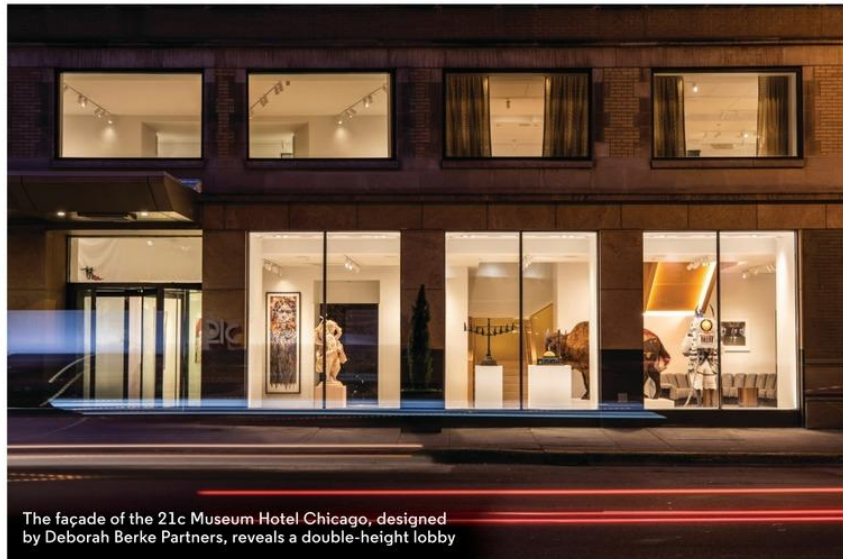
The façade of the 21c Museum Hotel Chicago, designed by Deborah Berke Partners, reveals a double-height lobby