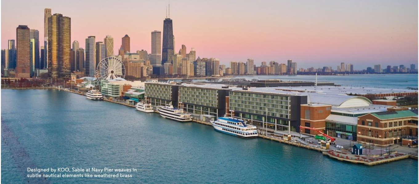
Designed by KOO, Sable at Navy Pier weaves in subtle nautical elements like weathered brass

Whether repurposing old buildings into trendy hotels or planting a flag in emerging neighborhoods—like Ace Hotel Chicago 's debut in the West Loop (a collaboration between in-house Atelier Ace and Commune) in 2017 or Hoxton 's arrival in the Fulton Market District in 2019 (with public spaces by AvroKO)—Chicago is on the rebound from the economic and social hits wrought by the pandemic and last summer's Black Lives Matter protests. Hotel inventory has returned to 98 percent of its previous peak capacity of nearly 44,000 rooms, according to Choose Chicago, which also reported that it has booked 72 large meetings for the latter half of 2022, representing 1.7 million room nights.