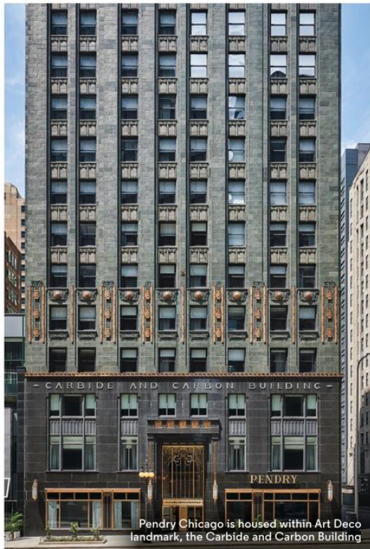
Pendry Chicago is housed within Art Deco landmark, the Carbide and Carbon Building