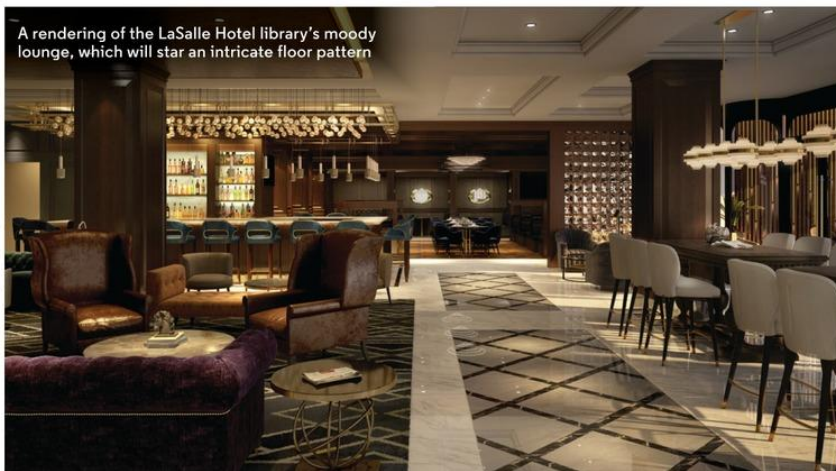
A rendering of the LaSalle Hotel library's moody lounge, which will star an intricate floor pattern