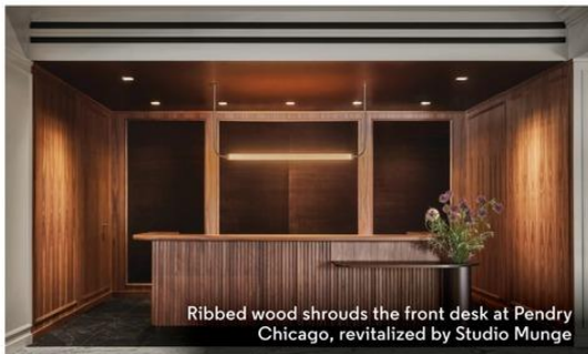
Ribbed wood shrouds the front desk at Pendry Chicago, revitalized by Studio Munge