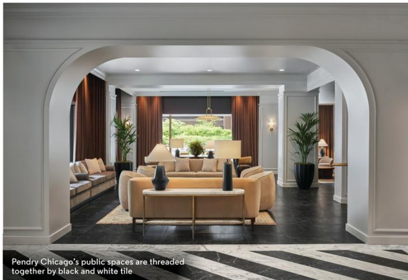
Pendry Chicago's public spaces are threaded together by black and white tile

No wonder, then, that about 20 major hotel projects have recently opened or are in the pipeline, adding 4,000 more rooms to the city's inventory. Included among them is the 115-room Nobu Hotel Chicago , a collaboration between local firms Modif Architecture and Studio K; 21c Museum Hotel Chicago , a 297-room transformation of the James Hotel by brand favorite Deborah Berke; and the Study at the University of Chicago , a 167-room new build by local architects Holabird & Root that was unveiled this fall. The 223-room Sable at Navy Pier also arrived last year.