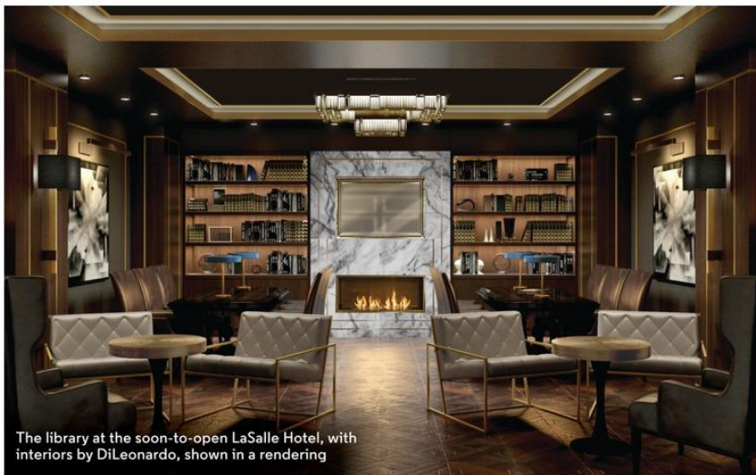
The library at the soon-to-open LaSalle Hotel, with interiors by DiLeonardo, shown in a rendering