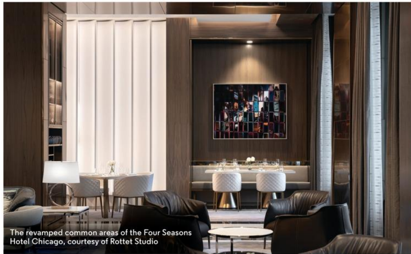
The revamped common areas of the Four Seasons Hotel Chicago