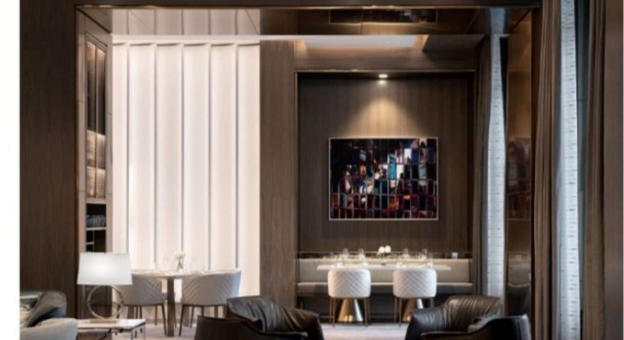
The revamped common areas of the Four Seasons Hotel Chicago