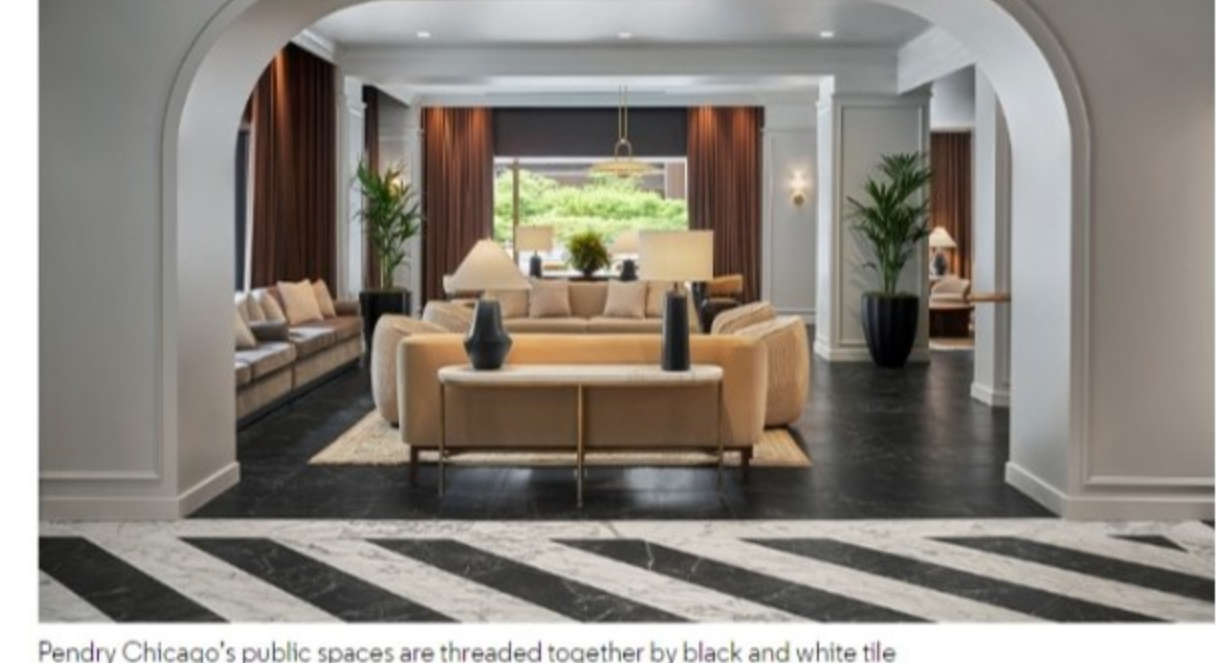
Pendry Chicago's public spaces are threaded together by black and white tile