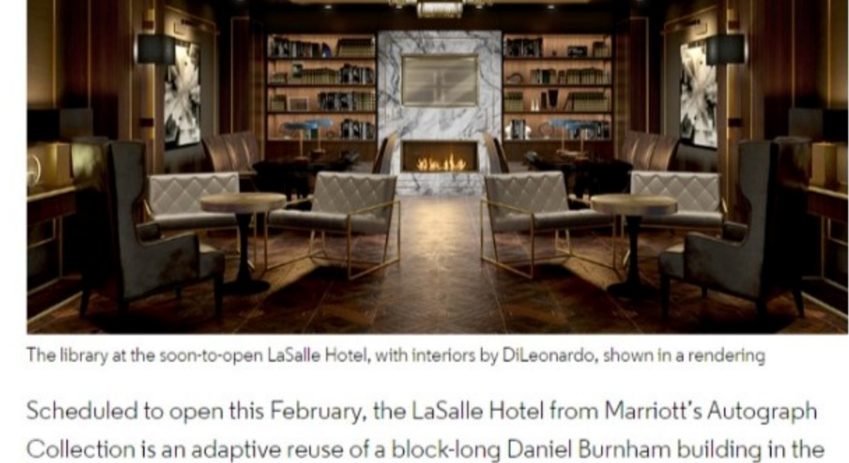
The library at the soon-to-open LaSalle Hotel, with interiors by DiLeonardo, shown in a rendering