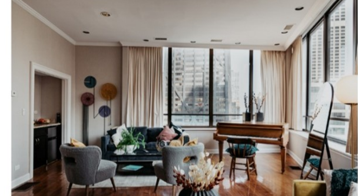
Panoramic views are a highlight in the Revive Interiors-designed suite at the Selina Chicago