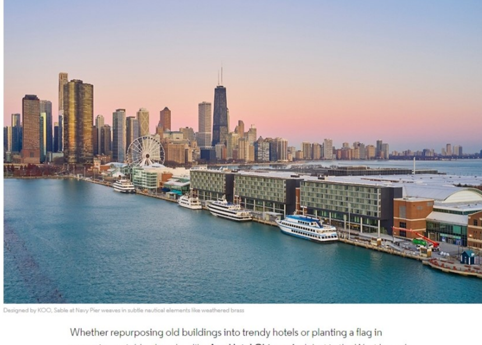
Designed by KOO, Sable at Navy Pier weaves in subtle nautical elements like weathered brass