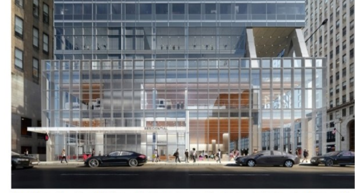
A rendering of the citizenM Chicago, which is slated to open in a downtown mixed-use development this spring

No wonder, then, that about 20 major hotel projects have recently opened or are in the pipeline, adding 4,000 more rooms to the city's inventory. Included among them is the 115-room Nobu Hotel Chicago , a collaboration between local firms Modif Architecture and Studio K; 21c Museum Hotel Chicago , a 297-room transformation of the James Hotel by brand favorite Deborah Berke; and the Study at the University of Chicago , a 167-room new build by local architects Holabird & Root that was unveiled this fall.